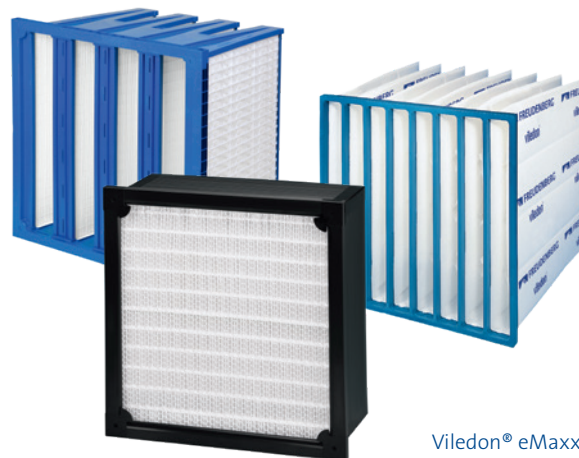
Viledon® eMaxx cassette filter, Viledon® MaxiPleat cassette filter, Viledon® Compact pocket filter T60

All participating filter manufacturers make their entire range of fine filter products available to Eurovent Certita Certification. Eurovent then selects a number of filters at random and subjects them to standardized laboratory tests at regular intervals. If deviations between the test results and the data sheet specifications fall outside allowable tolerances, the manufacturer is required to modify the published values. In the event of severe or more frequent discrepancies, further penalties can be applied, up to exclusion of the manufacturer from the certification program itself.