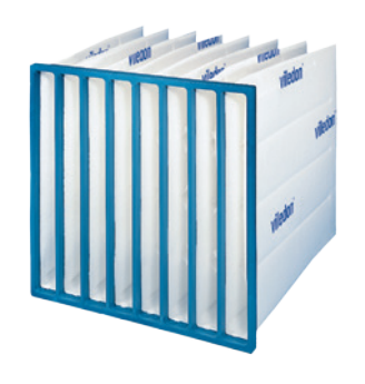
Viledon® Compact pocket filter T60

For the test run with the Viledon® Compact pocket filter T60 with filter class M6, the old filter wall was removed and a new filter wall with Viledon® mounting frames was installed. The Viledon® Compact pocket filter T60, made from multi-layered progressively structured nonwovens, provides high functional reliability thanks to its rigid construction and achieves superlative performance even during temporary overload operation. During the test period, the Viledon® Compact pocket filter impressed with a final pressure drop of 500 Pa and a lifetime of up to 24 weeks without dust breakthrough.